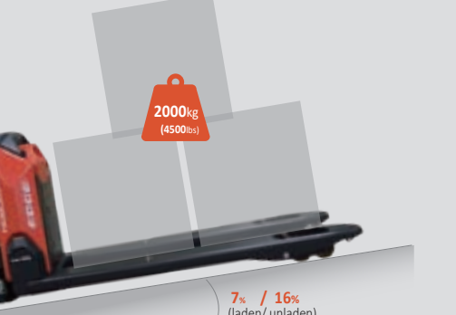
nd Pallet Truck 1150m 45.3in

The short body length of truck (L2=386mm/15.2in) is even smaller that the one of regular HPTs. It provides the shortest turning radius of 1280mm(50.4in)/1336mm(52.6in) with lifted/lowered forks and makes the truck extremely compact and ideal for use in confined spaces of retail stores, elevators or business centers.