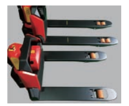
Optional different fork sizes