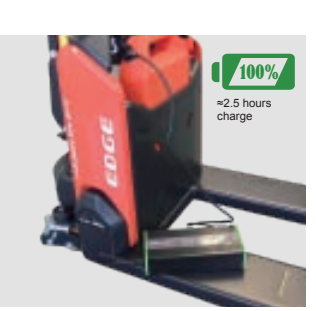
Socket on battery case for easy battery charging without necessity to take the battery out Fast and opportunity charging during brakes in operations increases working time.

The integrated BMS (Battery Management System) controls all important parameters and performance of lithium battery.